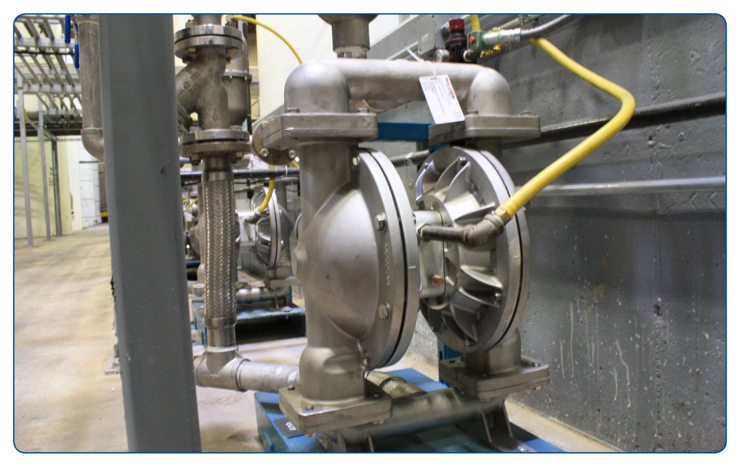
Advanced Air Distribution System (ADS) technology can reduce the operating costs for air-operated double-diaphragm (AODD) pumps in a number of industries, including chemical processing, food and beverage, oil and gas, pharmaceuticals and mining.

Success for industrial operations around the world can be measured in a number of different ways, such as Operational Equipment Efficiency (OEE), productivity and safety, to name a few. Almost always they can be grouped into one of three categories: Keeping operating costs low, keeping customers happy and keeping employees safe. Happy customers and safe employees are typically easy to identify and measure for most industrial plants. However, operating costs tend to have hidden components that are not so easy to spot.