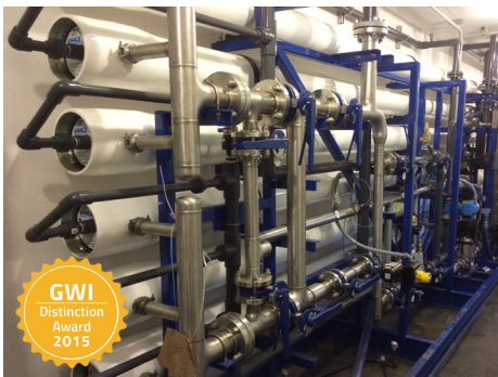
Cambria, California, United States

Nanofiltration or softening membranes have a pore size around 0.001 microns and are usually operated at pressures between 50 to 100 psi. Because of its pore size, NF is typically used on feed sources that have low total dissolved solids (TDS), but significant hardness, iron, manganese and/or total organic carbon (TOC). Nanofiltration membranes typically have a rejection of less than 85% of sodium chloride.