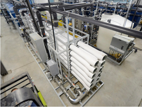
City of Winkler, Manitoba, Canada

The selection of the appropriate membrane technology amongst the various element types is strongly influenced by the raw water source, the application, the required treated water quality, and, sometimes, the associated operating and maintenance costs. Though NF and RO use different membranes, they operate the same way: water is forced through the semi-permeable layers of the membranes leaving behind the dissolved minerals, suspended solids and bacteria. Both systems will include feed pumps, piping, and valves. Only a portion of the feed water entering the NF or RO membrane system is turned into clean water. The permeate, the water that has passed through the membrane pore, is collected by the core tube to reach the next filtration steps. The concentrate, the minerals and other contaminants, are rejected by the system.