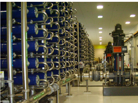
City of Cape Coral, Florida, United States

H2O Innovation designs, builds and commissions RO and NF systems for various applications and of different flow rates. The company's multidisciplinary teams have extensive water treatment knowledge and work closely with industry leaders to design appropriate systems with pertinent parts and features.