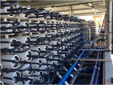
Leo J. Van der Land, California, United States

The selection of the appropriate membrane technology amongst the various element types is strongly influenced by the raw water source, the application, the required treated water quality, and, sometimes, the associated operating and maintenance costs. Though NF and RO use different membranes, they operate the same way: water is forced through the semi-permeable layers of the membranes leaving behind the dissolved minerals, suspended solids and bacteria. Both systems will include feed pumps, piping, and valves. Only a portion of the feed water entering the NF or RO membrane system is turned into clean water. The permeate, the water that has passed through the membrane pore, is collected by the core tube to reach the next filtration steps. The concentrate, the minerals and other contaminants, are rejected by the system.