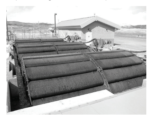
Town of Manhattan, Montana, USA 1,515 m3/d (278 gpm) Montana Grand Project Award winner