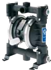
Husky 716 3/4 in (19.1 mm) connection Max flow: 16 gpm (61 lpm) Aluminum, stainless steel