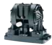
Husky 205 1/4 in (6.3 mm) connection Max flow: 5 gpm (19 lpm) Polypropylene, acetal, PVDF

Available materials of construction and accessories may vary depending on pump model.