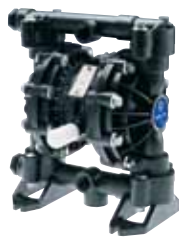
Husky 515 1/2 in (12.7 mm) connection Max flow: 15 gpm (57 lpm) Polypropylene, acetal, PVDF