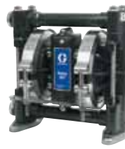
Husky 307 3/8 in (9.4 mm) connection Max flow: 7 gpm (26 lpm) Polypropylene, acetal