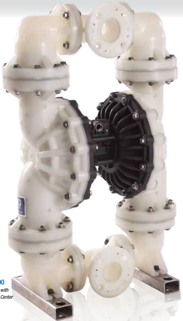
Husky 3300 Polypropylene with Polypropylene Center

DataTrak™ available to prevent pump runaway and track material usage