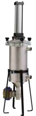
DCF-800 - One actuator delivers simple, reliable operation with water-like liquids. Ideal where a low initial investment is a key driving factor