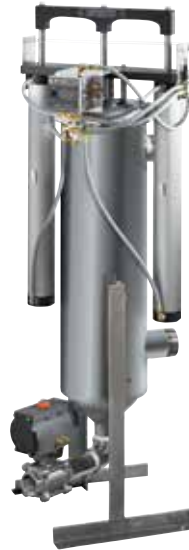
DCF-1600 - Two actuators isolate the actuation mechanism from the filtrate with a bridged system. The benefit is a long operating life in challenging conditions.