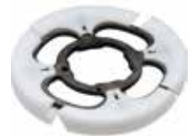
Our unique circular cleaning disc design (MCF design shown) ensures intimate contact with the screen to thoroughly and uniformly clean the media.