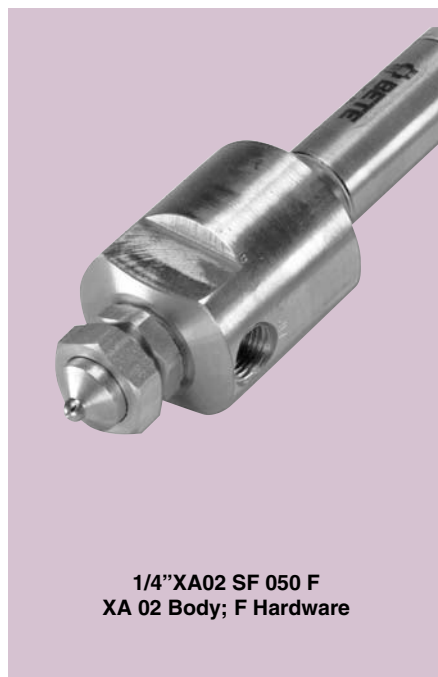
1/4" XA02 SF 050 F XA 02 Body; F Hardware

Dimensions are approximate. Check with BETE for critical dimension applications.