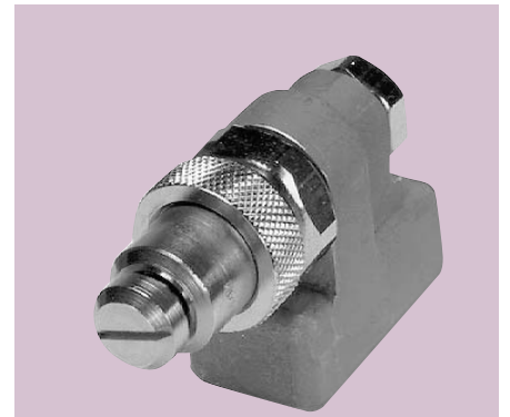
1/4" XA 03 XW050 A XA 03 Body; A Hardware

CALL 413-772-0846 Call for the name of your nearest BETE representative.