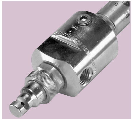
1/4" XA 01 FF050 F XA01 Body; F Hardware