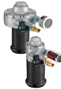
Air (M6A, M6XA)