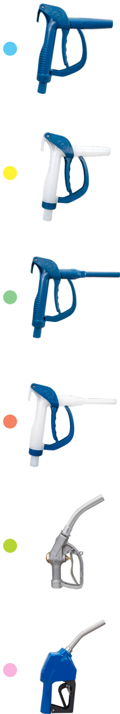
SS Nozzle not manufactured in U.S.A.